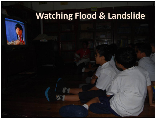
Watching Flood & Landslide