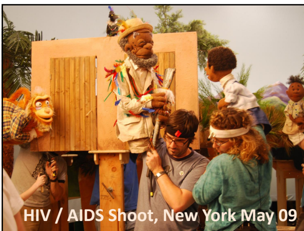
HIV / AIDS Shoot, New York May 09