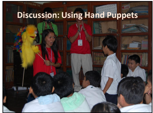
Discussion: Using Hand Puppets